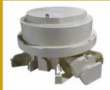
Crusher Machine Wooden Pattern