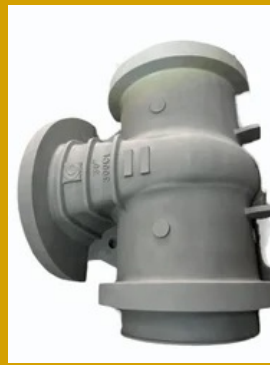
Wooden Gate Valve Pattern