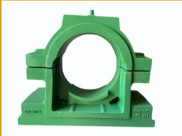
Wooden Foundry Pattern