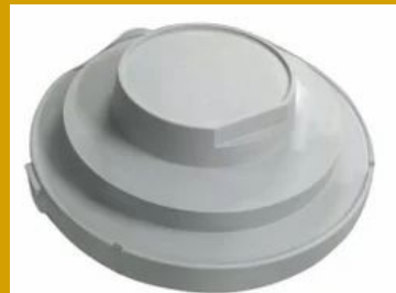
Butterfly Valve Pattern