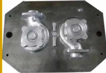
Aluminium Pump Casting Pattern