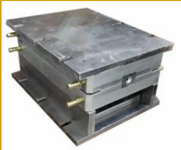
Investment Casting Auto Die