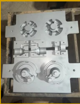
Cnc Machining Pattern