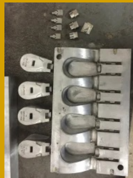
Automotive Investment Casting Die