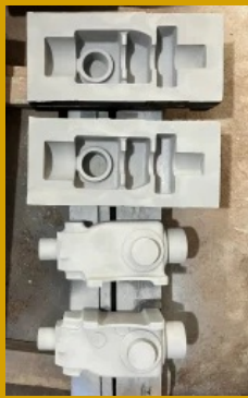
Wooden Pump Pattern