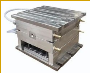
Aluminium Investment Casting Die