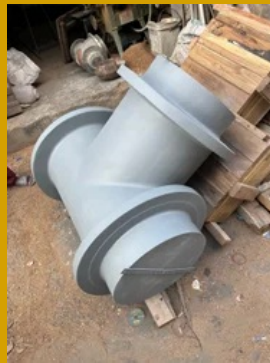
Cast Iron Foundry Patterns