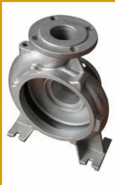
Pump Investment Casting Die