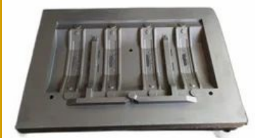
Aluminium Casting Pattern