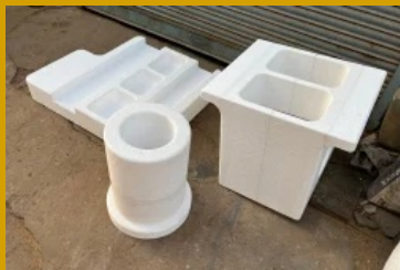
Thermocol Foundry Pattern